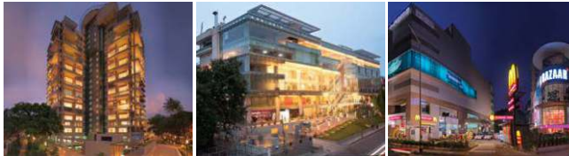
SKY GARDENS BENGALURU