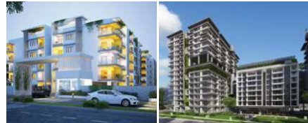
G:CORP MAHALAKSHMI BENGALURU